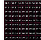
CRACK N SNAP PRICING KIT